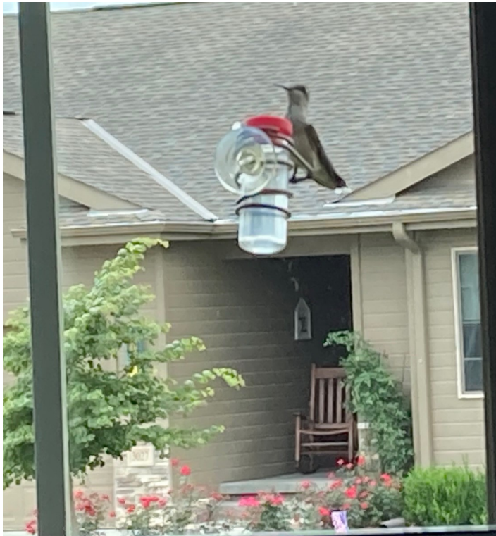
A hummingbird was spotted on Lakeside Drive last month for a refreshing drink before heading out.

I phoned my wife earlier and asked her if she wanted me to pick up fish and chips on my way home from work but she just grunted at me. I think she still regrets letting me name the twins