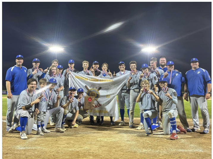
The Class B champs celebrate after winning the title.

"I thought it was going to last a little longer," he said. "It was like snapping my fingers and it was over."