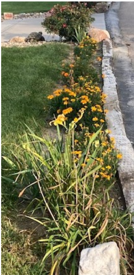
This display of flowers is located at the edge of Buccaneer Boulevard.

Hospital (which in 1997 merged with the Nebraska Medicine campus). She's been there ever since. Her official title now is surgical purchasing senior analyst. She's charged with purchasing the hospital's surgical instruments and capital equipment. Last June marked her 44th year there.