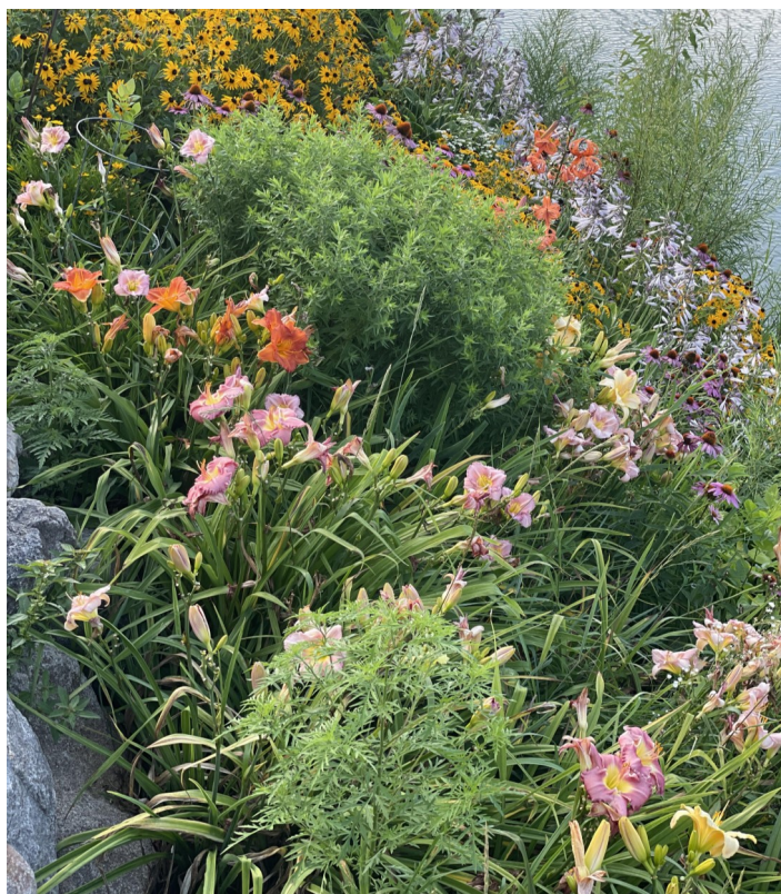
Flowers dominate the landscape near the edge of Sailboat Lake. They come literally from all over the world.