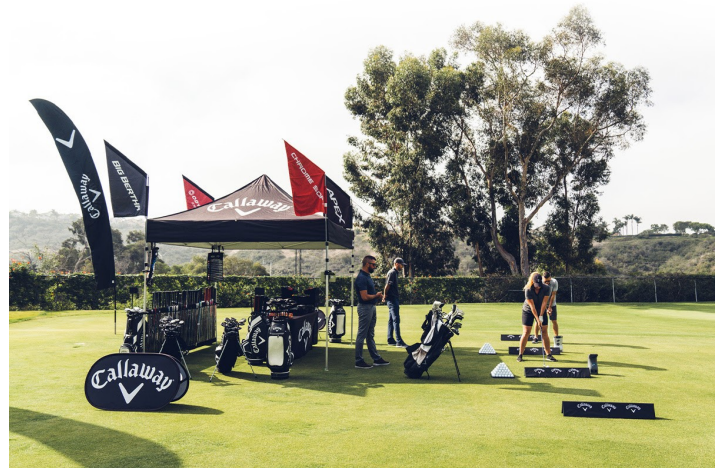
Callaway reps will be on hand for a fitting session June 5, from 4 to 7 p.m.

Eight groups took part in the opening Friday Couples Fun Night outing on May 19. It's a 9-hole event with the format changing each month. The opening night was played under