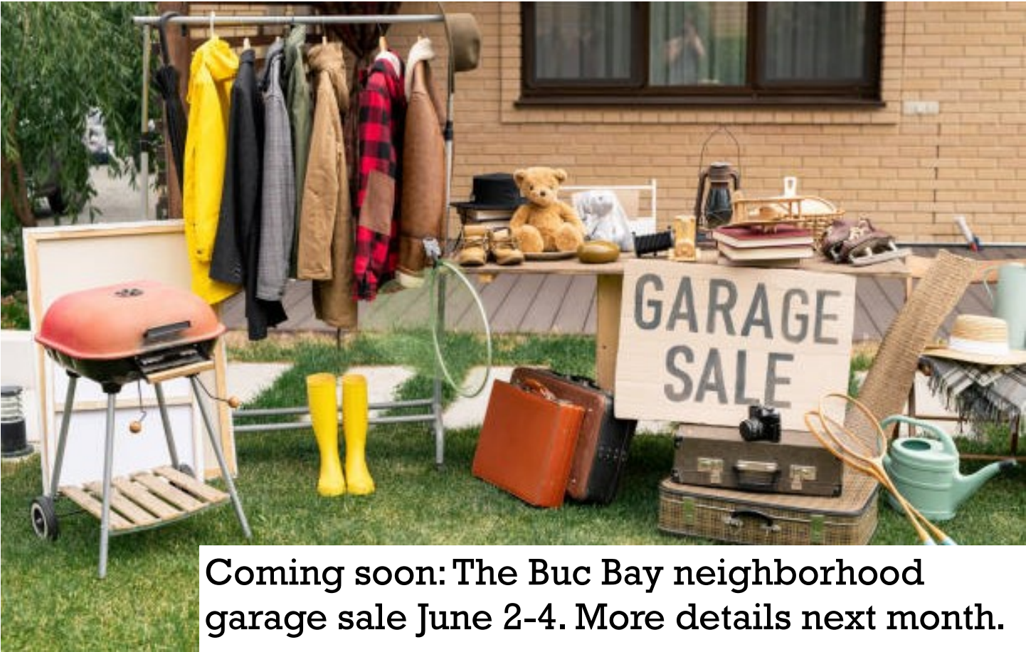
Coming soon: The Buc Bay neighborhood garage sale June 2-4. More details next month.